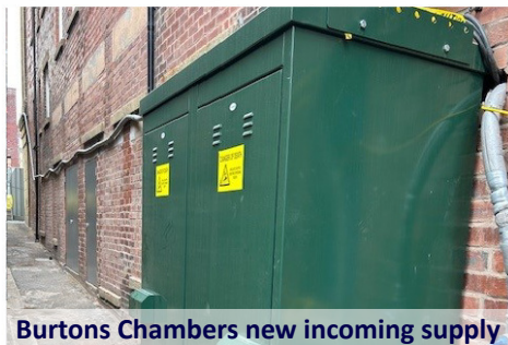
Burtons Chambers new incoming supply

At Burtons Chambers , the metal doors have all been installed and the new shopfronts are nearly complete, with just a few final snagging items left to wrap up. The paving outside has been reinstated ahead of final utility works.