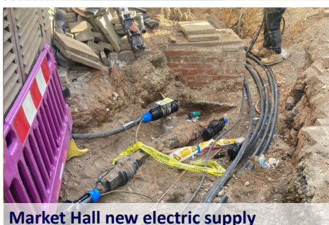
Market Hall new electric supply