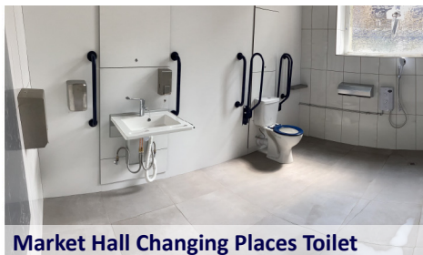
Market Hall Changing Places Toilet