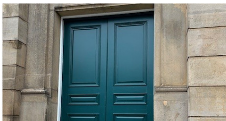
Market Hall refurbished doors

The tender for Phase 2, for the upcoming internal fit-out works for both buildings, is ongoing and due to begin by this summer.