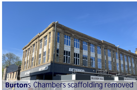
Burtons Chambers scaffolding removed

Planning and procurement for the next phase, the internal fit-out works to both buildings, is underway and this work is due to start in July.