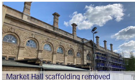
Market Hall scaffolding removed